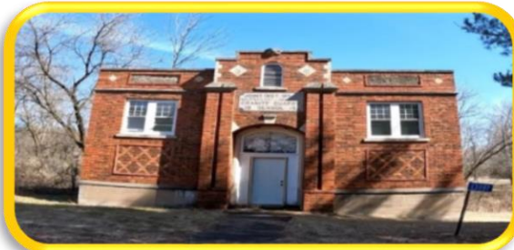
Fun sites along route: Granite Quarry School 1919

Since there is great overlap of desired recreational routes and parks in the Greater Waupaca Area, GWAPT wants to be seen as a coordinating group between towns surrounding Waupaca and the City to encourage cooperation and enhance recreational enjoyment and the economy of the Greater Waupaca Area.